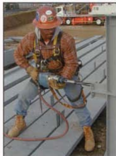
Bridge Reamer Bridge Reamer Holders